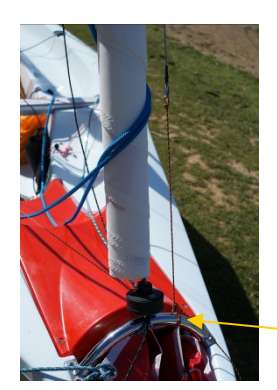
Attach jib forestay to bar on bow